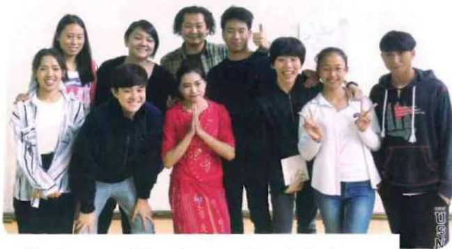
The team with local university students