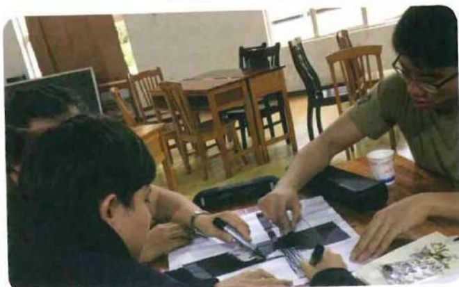
Preparing props for talent show

Since the day we touched down in China, we had been cautious about our speech in public and watchful about our surroundings. Even when the lessons started, we were cautious to ensure that whatever we taught was just English and there were no elements of religion to it. However, there were several Christians among the group of students whose purpose was to bond with the non-believers, hoping to bring them to Christ. Despite the lack of receptiveness to Christianity, the local Christians were not afraid to proclaim their religion, never failing to make references to the Bible whenever possible and prayed openly before meals. This led me to ponder why I was afraid to be frank and to proclaim the fact that I am a Christian. Jesus put us in this world so that we may be light in the darkness. By being afraid, I was not doing what Jesus wanted me to do. On the later days of the English camp, I started to converse on a more personal level to some of the locals there and also told them bible stories when possible to get them interested. Though not all of them responded positively, there were a handful who got interested and even asked me further questions and requested me to tell more stories from the Bible. This taught me that while doing God's work, we should not be afraid of anything.