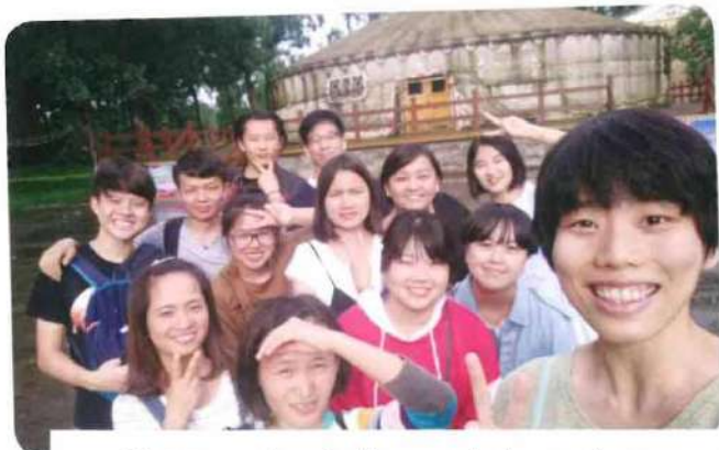
Visiting cultural village with the students