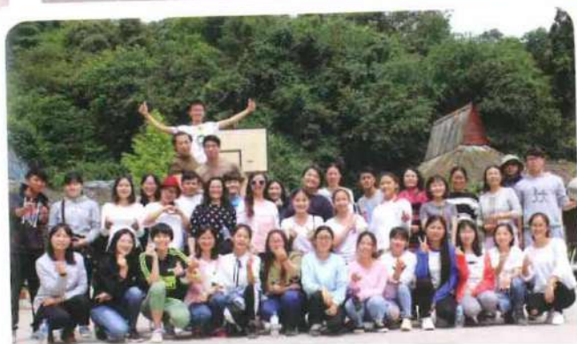
Group photo after Captain's Ball session